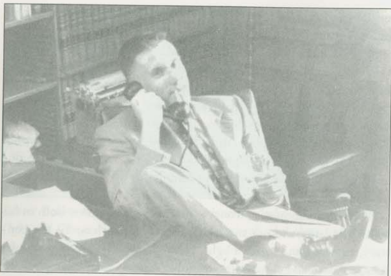
Rehnquist at ease in Justice Jackson's chambers.