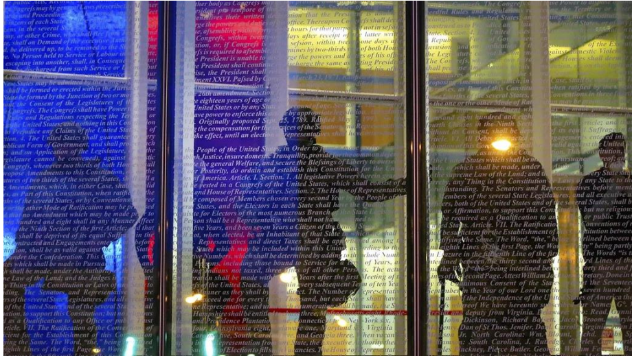
June 1, 2020: At curfew declared by Buffalo’s mayor, law enforcement officials look out from the Jackson Courthouse on police officers removing people from Niagara Square.

These possible viewers and readers include public servants, such as police officers. An officer could, looking into the Jackson Courthouse, be reminded that he and every federal, state, and city employee is sworn to uphold the Constitution.