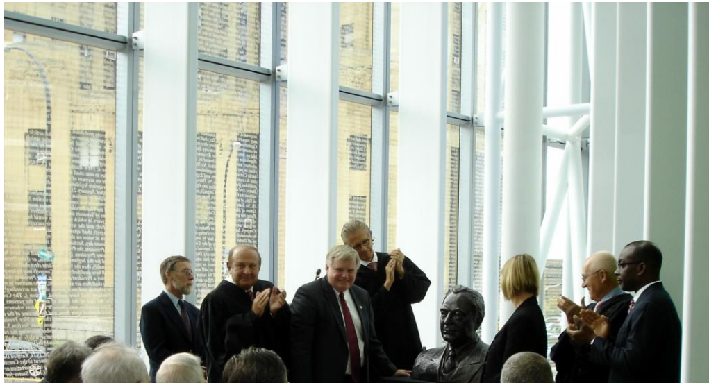
September 30, 2013: Robert H. Jackson U.S. Courthouse name and Jackson bust unveiling; Buffalo City Hall, next door, is viewed through the etched glass.

One of the Courthouse's most notable features, in its pavilion lobby, is a series of large glass panels. They face Niagara Square, including City Hall. The panels display, etched into the glass, the words of the U.S. Constitution.